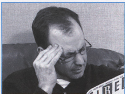
Headache caused by clenching

When muscles have been constantly contracting, they become tense and sore. Clenching keeps the muscles involved in opening and closing your jaw in a constant state of tension and varying degrees of pain. It can also strain your sinuses and cause your neck to feel stiff.